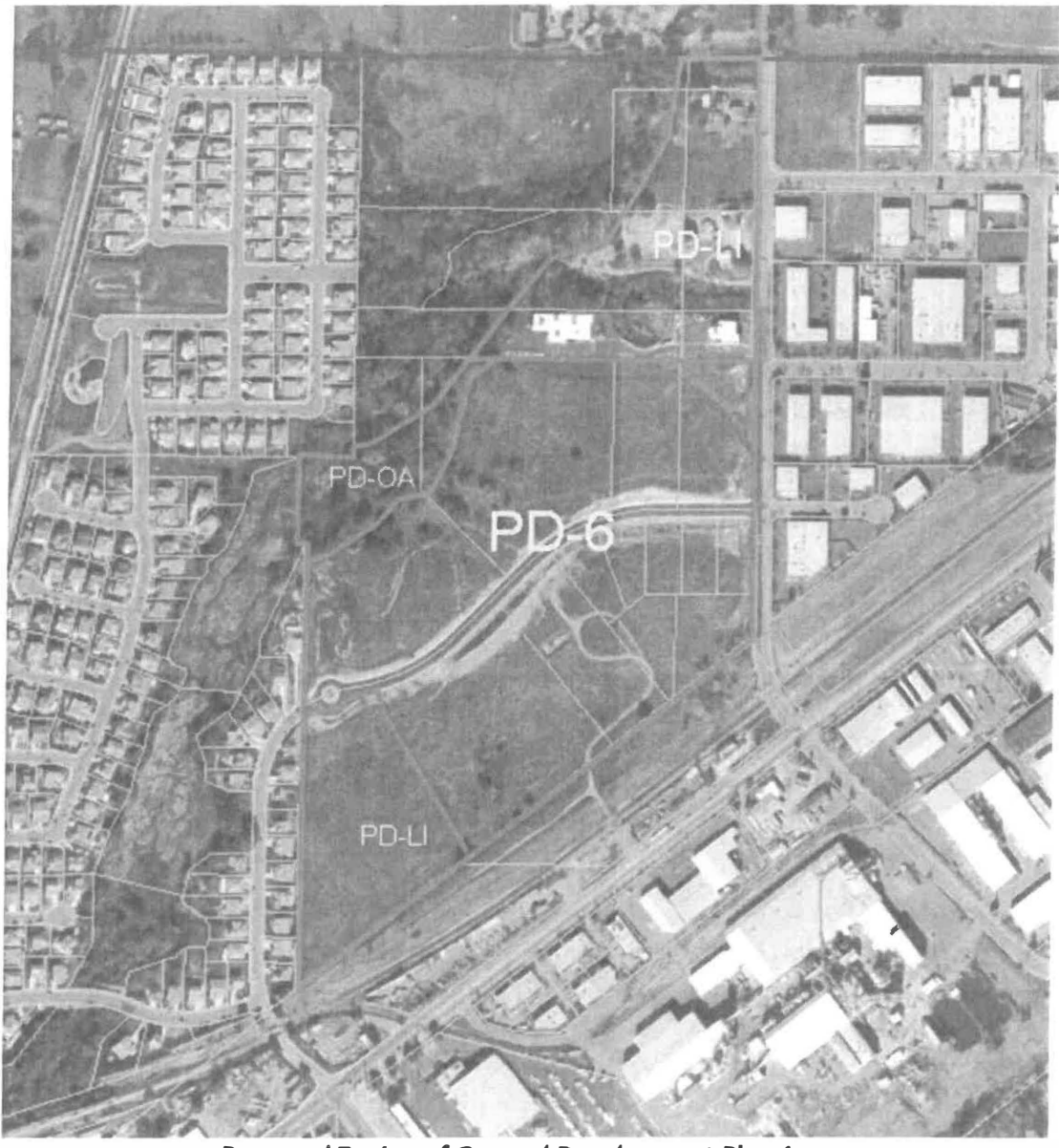
Proposed Zoning of General Development Plan Area