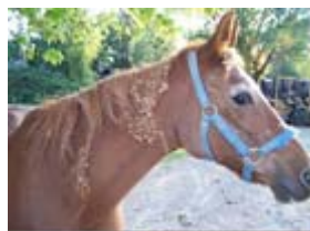
Horse found with Burrs in its Mane.

successful operation was another step in accomplishing a key element of our mission: promoting a safe community—for people, as well as animals.