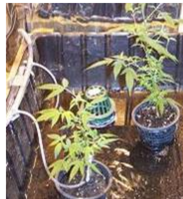
Marijuana grow found in an outdoor closet.