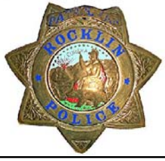
Issued Patch and Badge 1974 to 1976 (Note the top rocker says "PATROLMAN")