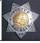
Issued Patch and Badge prior to 1974