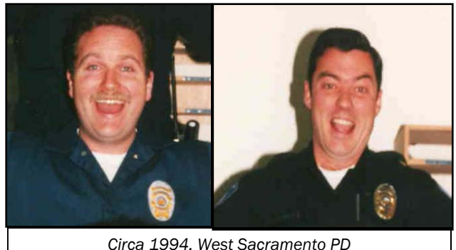
Circa 1994, West Sacramento PD

You really do! We are truly fortunate the Community of Rocklin genuinely cares and supports their public safety professionals, and we work in a police department which strives to make this the best place it can be. As the incredibly compassionate and devoted public servants you all are, together as a team we continue to make Rocklin PD an innovative police department committed to a pursuit of excellence and dedicated to protecting the citizens of Rocklin and serving mankind. As a large, extended family, Rocklin PD really accomplishes amazing things. But let's focus on you as an individual for a moment. Serving in a profession that artfully transitions from calm and serenity to chaos and disorder and back again all during a days work comes with a hefty toll (but only if we allow it to). Dealing