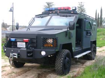
Tactical Response Vehicle

These officers are commended for their commitment in preparing for and successfully completing this grueling testing process. Congratulations and good luck.