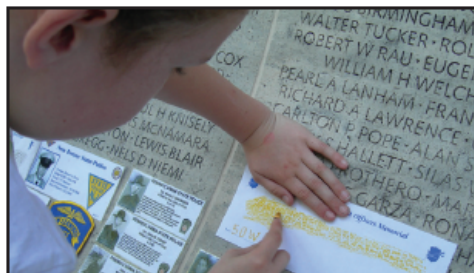
A surviving CHP child makes a rubbing of her father's name at the National Law Enforcement Officers Memorial.