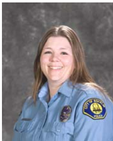
Dispatcher of the Year