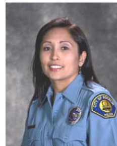
Professional Staff Person of the Year