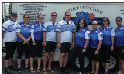
Officers and survivors from Elk Grove PD, Rocklin PD, Sacramento Sheriff's Dept., and the CHP at the 2011 Police Unity Tour.

Thank you for helping us "ride for those who died"!