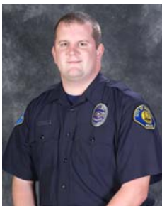
Officer of the Year