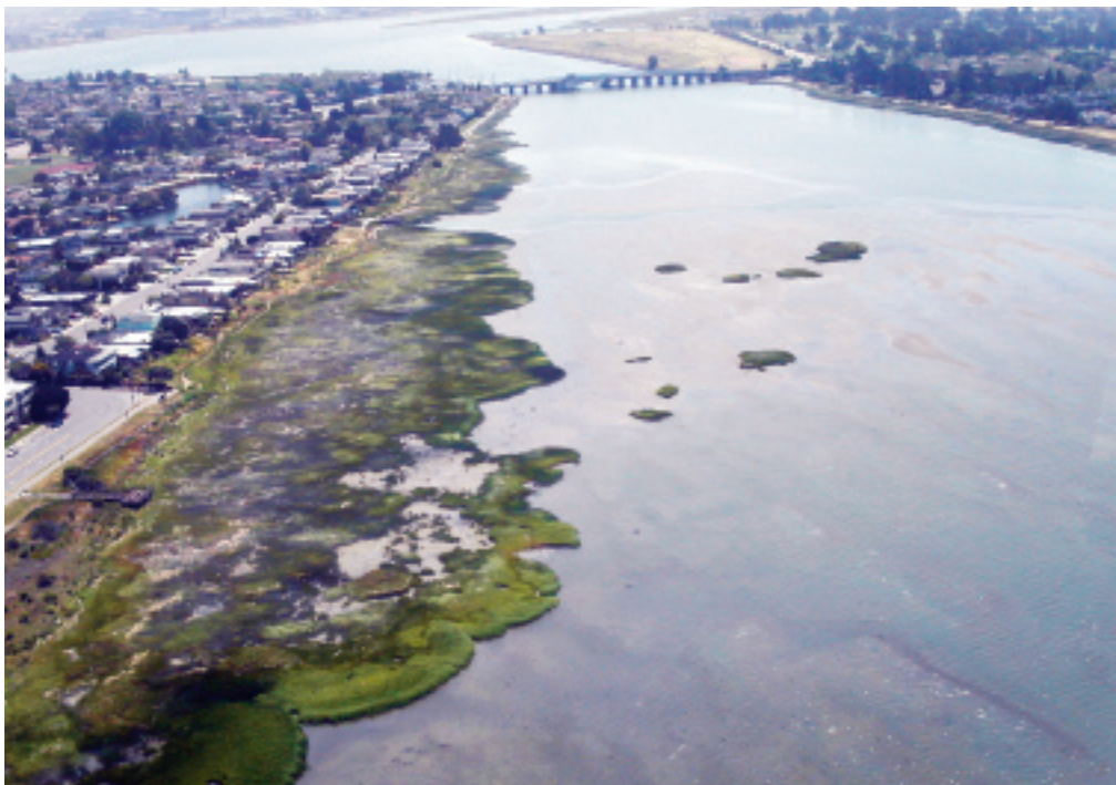
Circular clones of Spartina alterniflora x foliosa (smooth cordgrass hybrid) spread in San Francisco Bay.

(Affiliations for identification purposes only)