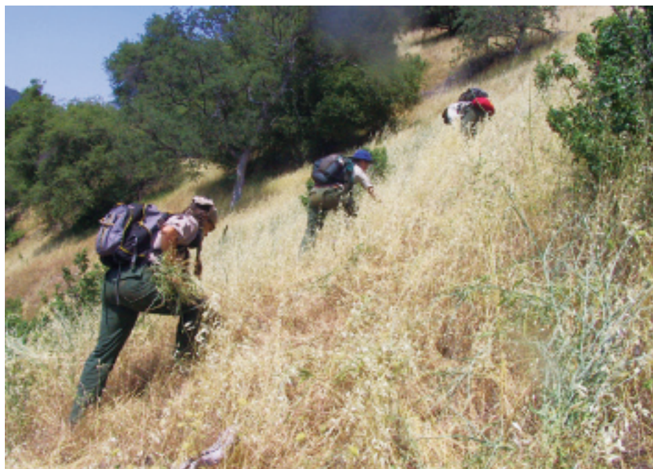
The Nation Park Service's Exotic Plant Management Team removes satellite infestations of Centaurea solstitialis (yellow starthistle) to prevent the plant's spread.