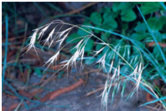
When Bromus tectorum (downy brome or cheatgrass) replaces native perennial grasses, the frequency of wildfires shortens from 60-100 years to 3-5 years.

The core of the Inventory is Table 1, which lists those plants we have categorized as invasive plants that threaten California wildlands.. The types of information contained in Table 1 is described below.