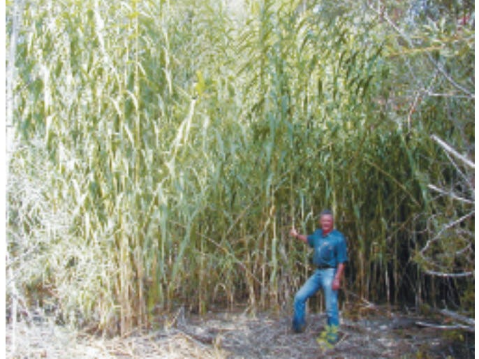
In the past 15 years, approximately $15 million has been spent statewide to control Arundo donax (giant reed) in California.

It is important to note that every species listed in Table 1 is invasive, regardless of its overall rating, and should be of concern to land managers. Although the impact of each plant varies regionally, its rating represents cumulative impacts statewide. Therefore, a plant whose statewide impacts are categorized as Limited may have more severe impacts in a particu-