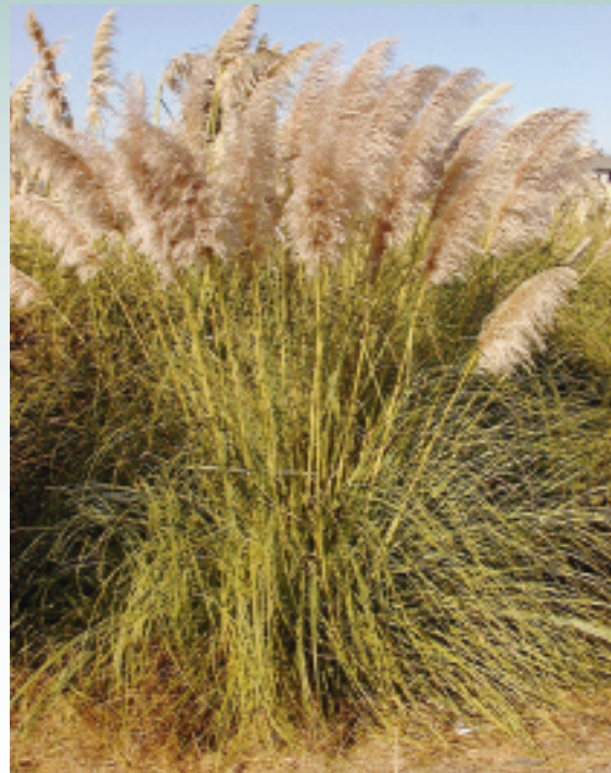
Pampasgrass ( Cortaderia selloana ) displaces native plant communities in coastal habitats.