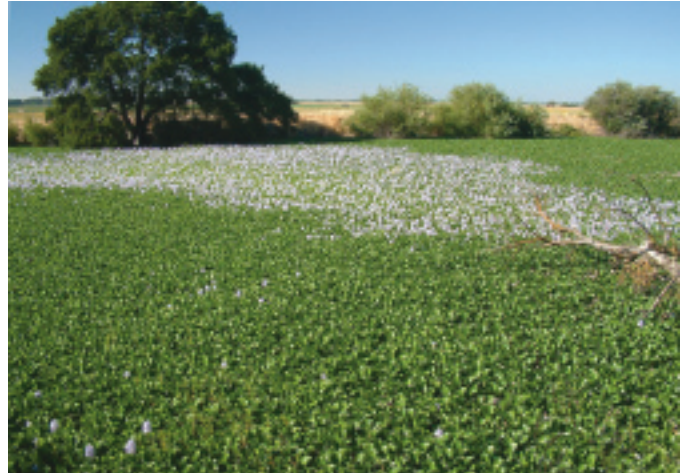
Dense mats formed by aquatic plants such as water hyacinth ( Eichhornia crassipes ) reduce habitat for waterfowl and fish.

Complete description of criteria system and detailed plant assessments available at www.cal-ipc.org .