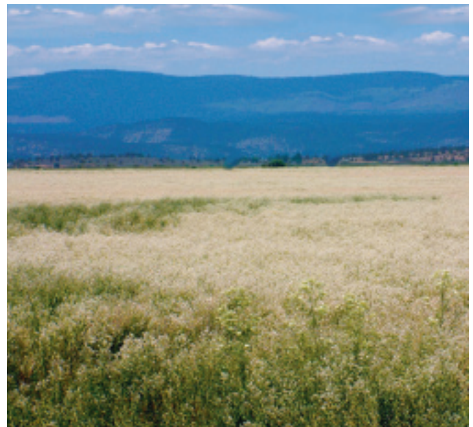
Lepidium latifolium (perennial pepperweed or tall whitetop) concentrates salt in marsh soils, threatening several rare plant species.