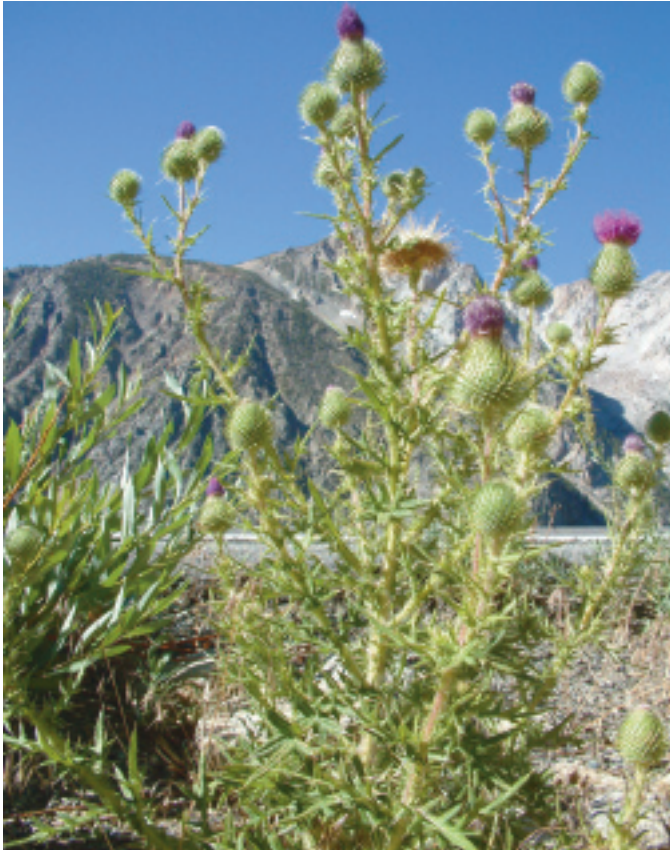
Cirsium vulgare (bull thistle) is spreading at high elevations, such as in Yosemite National Park.