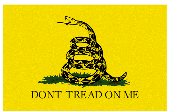
Early Gadsden Flag of the American Colonies, c.1775

preserve our uniformity and our rules prohibit individual-