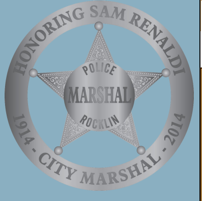
In this issue.....